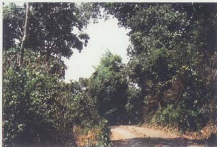
Fig. 1. Road leading to Los Mazos microwave tower at about 1400m, above Puerto Los Mazos, on Hwy. 80, SW of Autlán, Jalisco, Mexico (Sierra de Manantlán).